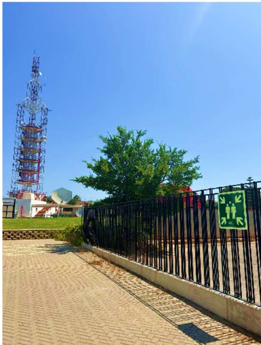
ASSEMBLY POINT - GVA PARKING